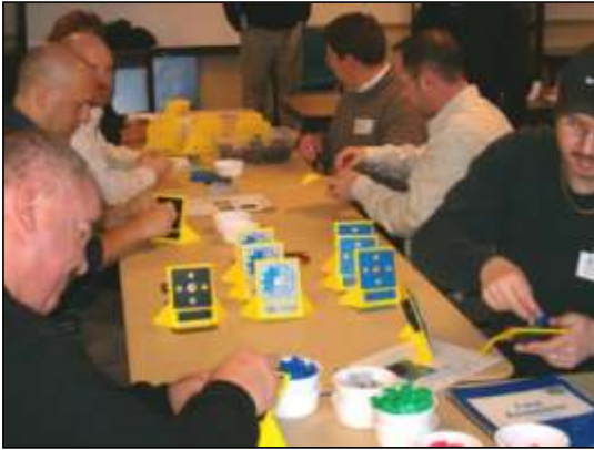
Special Training Events