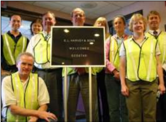
Educational Field Trips