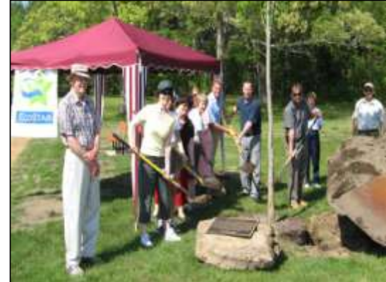
Community Betterment Projects