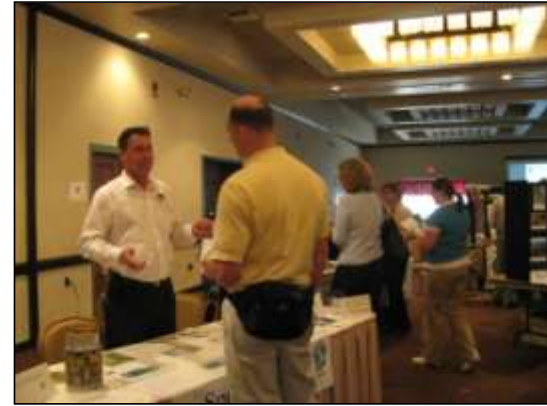
Every Day is Earth Day Celebration