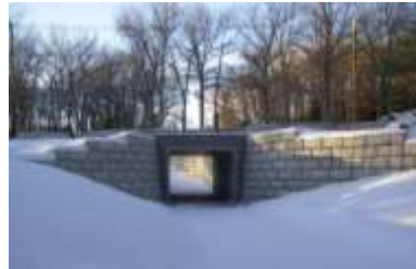
Golf Cart underpass—Patton Road.

tric substation at Cavite and Saratoga to better serve the Barnum Road and West Rail Industrial Park, as well as drinking water well upgrades for Shebokin and MacPherson wells. Wetland Orders of Conditions were issued for a number of these projects due to all or a portion of the construction activity occurring within 100 feet of wetlands. The DEC also permitted and MassDevelopment