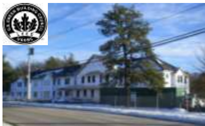
Transitions Housing—12-unit multi-family housing construction on Cavite Street.

Transitions Housing for women, a 12 unit apartment facility located to the south of Cavite Road was approved for construction and as the year ends, the building envelope is almost fully enclosed, with interior fit up to begin shortly. This facility was also de-