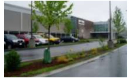
Biofiltration landscape islands in front of Evergreen Solar facility on Barnum Road.

In March, 2009 the DEC received complaints about possible violations of its industrial performance standards for noise. The DEC investigated and found Evergreen Solar in violation of its Regulations. With input from the impacted neighbors and the Town of Harvard's elected officials a Noise Resolution was adopted by the DEC which set forth a path for Evergreen Solar to follow to bring their facility into compliance with DEC Regulations and the Noise