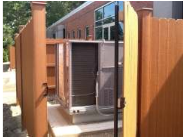
Sound enclosures for HVAC

Saratoga Substation – The DEC approved the development of this substation back in 2009. Development was substantially complete in 2010, however the required landscape berm was not finished until this past May. The required landscape berm provides topographic as well as vegetative screening of the substation from nearby residents on Bates and the new Transitions multi-family development on Cavite. The landscape berm also physically cuts off the street connection between Cavite and Saratoga – a portion of road that was formally abandoned by MassDevelopment and the DEC in May 2011.