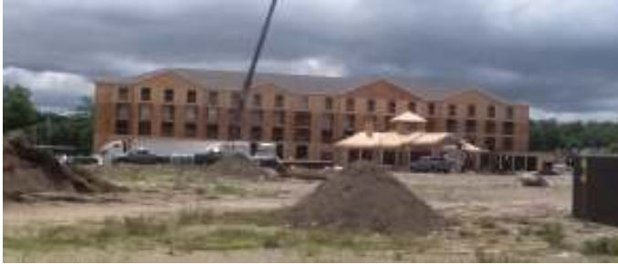
Hilton Garden Inn – Core and shell construction – June 2011