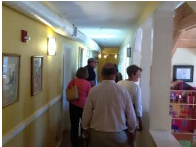
Participants walking through one of the naturally daylighted corridors in the Transitions shelter.

Regulation Updates – Staff has been working on a number of updates to various sections of the regulations to bring them up to date with current state requirements, innovative low-impact development techniques for stormwater management and other new best management practices that project may choose to utilize. These updates will provide Applicants as well as existing businesses with more options when planning a project and/or renovation in Devens. Staff brought forward these Regulations for approval in late September: