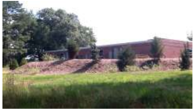
Rear of Laddawn from El Caney (landscape berms and screening)