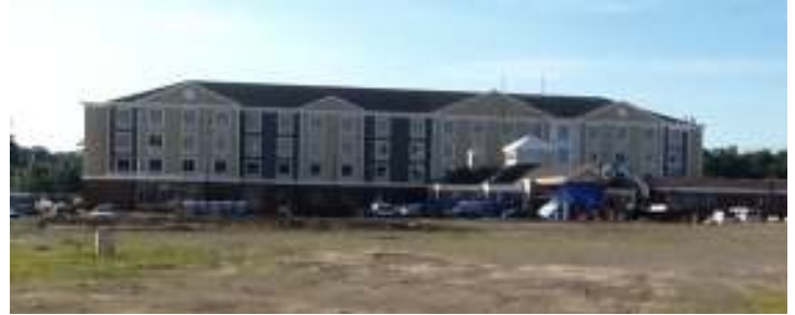
Hilton Garden Inn exterior nearing completion – August 2011

American Superconductor (AMS) License to Store Flammables – The DEC approved a license for AMS to store up to 51,000 cu.ft. back in May. AMS has yet to begin construction but anticipates pulling permits in the near future and their goal is to be complete by the end of August.