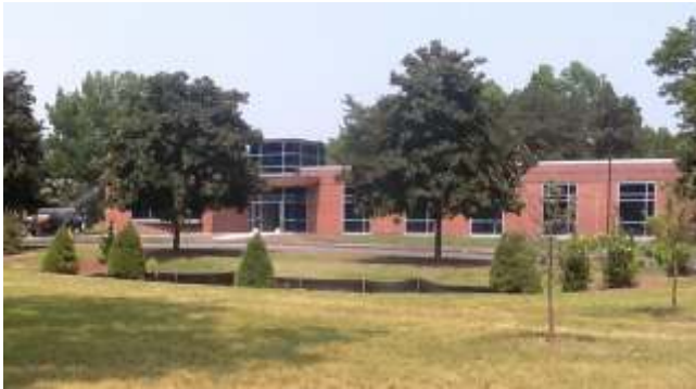
155 Jackson Road – November 2010

155 Jackson Road – Laddawn – Redevelopment of the former Davis Library as Laddawn’s new corporate headquarters is complete. The roof-top mechanical units have been relocated to ground level, and additional landscape screening has been put in place to screen these areas. The fencing that is screening the HVAC units is made out of a sound-absorbing material that makes the HVAC units virtually inaudible from the property line. The parking lot lighting was lowered in height and the voltage was decreased to reduce the lighting levels on-site, while still maintaining safety. The lights are recessed and an evening inspection found no off-site glare. The lights are on a timer as well and will not stay on overnight – further reducing any potential impacts to neighboring residents.