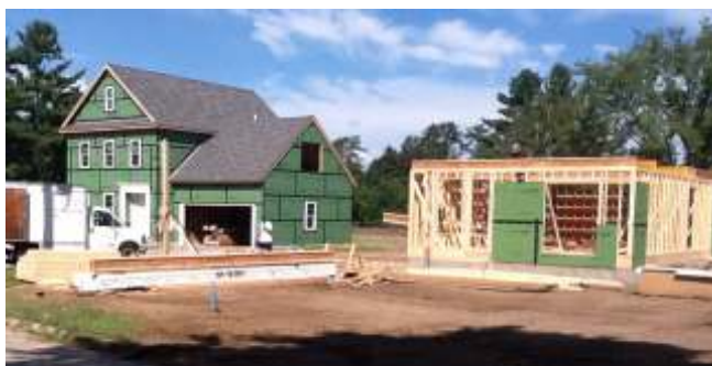
Lot #2 house shell and roof completed and Lot #3 house first floor framing. August 2011

Devens Sustainable Housing Project – The construction of the first new single-family home in this eight lot zero-net energy subdivision is nearing completion and construction of the second zero-net energy single family home is well underway. The developer has indicated that they will be installing solar photovoltaic panels on the homes which may result in the homes actually producing more energy than they consume in a typical year – potentially making these energy-positive homes.