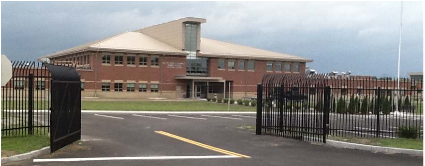
New Army Training Building on Barnum Road - September 2011

The DEC is still working with the Army to ensure the long-term groundwater monitoring wells and monitoring plan, in addition to spill prevention, pollution and control plans, required as part of the development permit for the site, are implemented by the Army to further ensure long-term protection of groundwater resources.