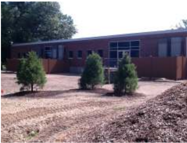
Rear HVAC screening/sound attenuation and additional landscaping