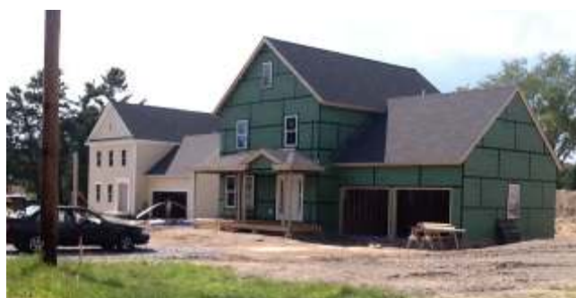
Lot #2 siding, windows and deck installed. Lot #3 house shell and roof completed – September 2011

Devens Household Hazardous Products Collection Facility – The facility is now open and has been steadily increasing business as more people learn about the service. The facility has missed one day of operation so far due to rain but they hope to secure funds in the near future for a permanent canopy which will allow them to operate in all weather conditions. The official ribbon cutting ceremony on July 26, 2011 received a great deal of praise from State legislators and representatives as well as the Department of Environmental Protection who were in attendance. This regional permanent collection facility is the first of its kind in Massachusetts.