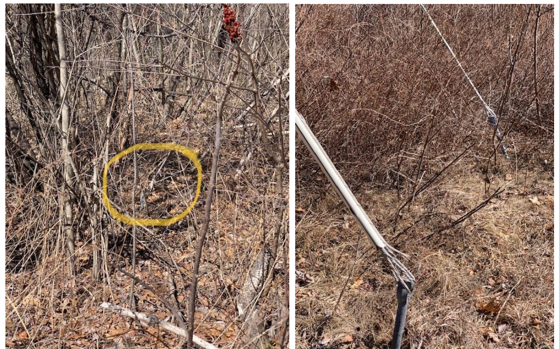
Support cable in Wetland - March 23, 2021