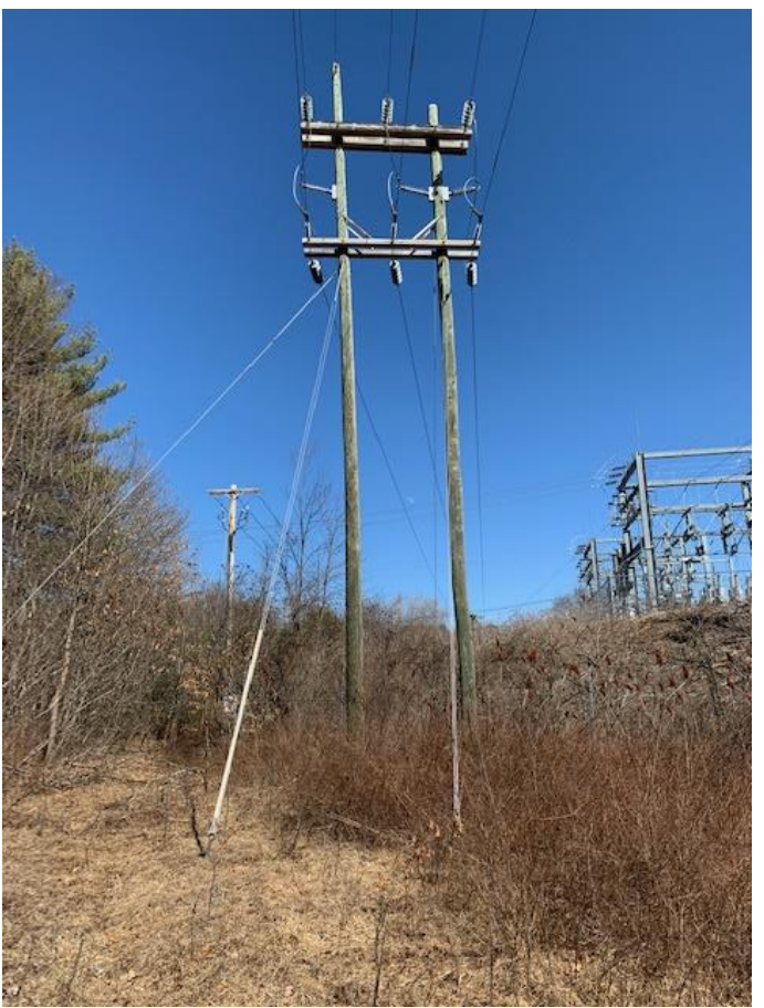
Consolidated Poles - March 23, 2021